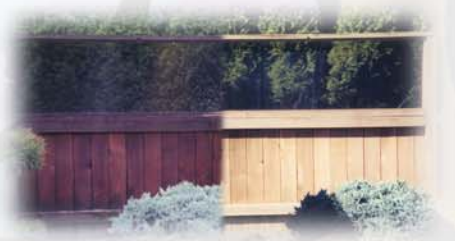
A wood fence before and after Strip & Brite

Strip & Brite by Timber Pro Coatings • www.timberprocoatings.com