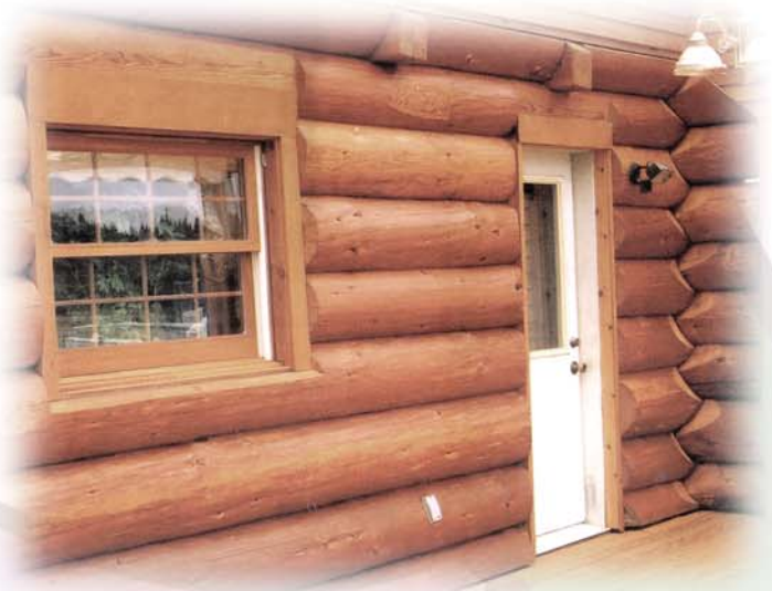
Above: Before and after Strip & Brite applied on the weathered wood of this log home