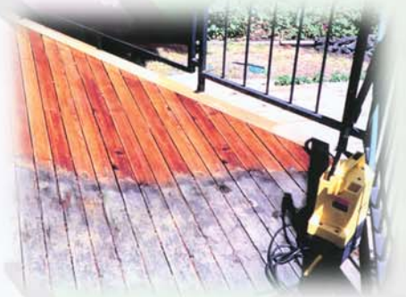
Strip and Brite works magic on weathered decks

The gel is accompanied by a packet of crystals used to make the solution for this two step system. The two solutions are companions in the stripping process. Strip & Brite is a biodegradable product and will not harm vegetation if used according to directions.