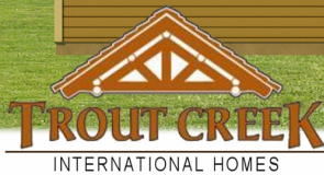
The River Springs